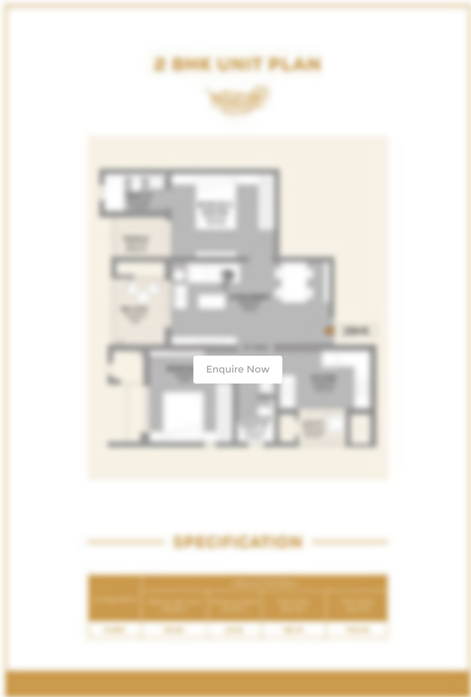
Floor Plan 2