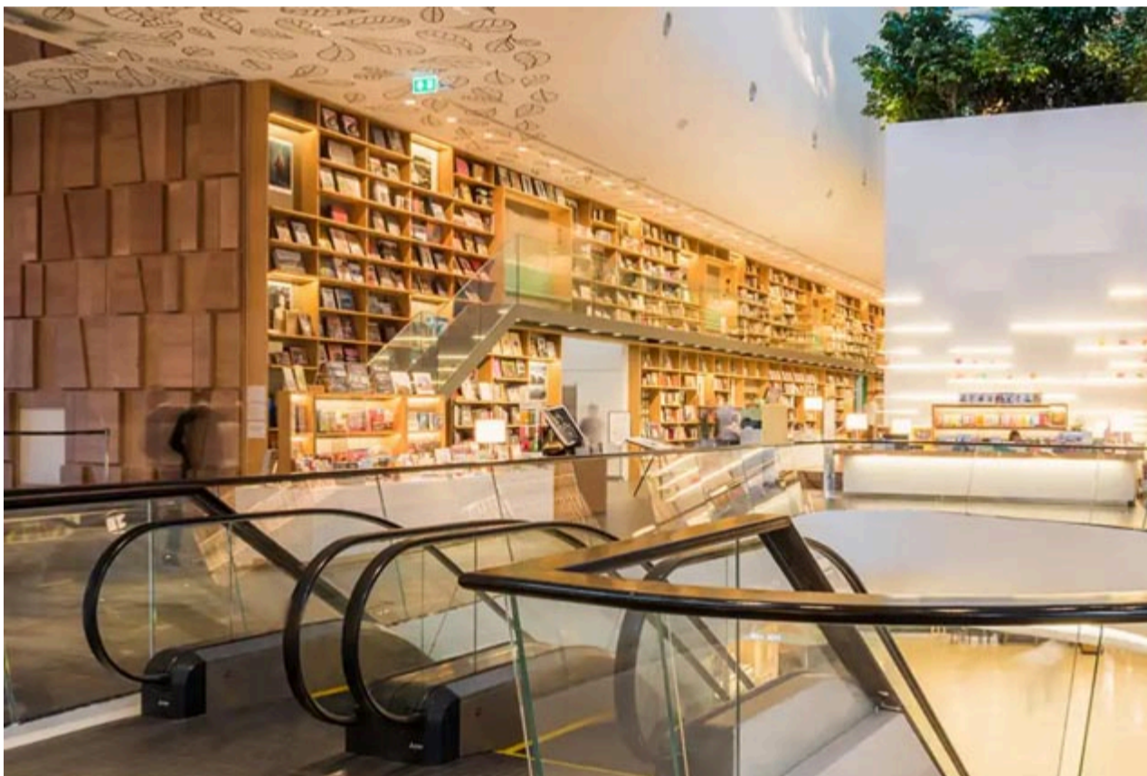
Complete Costing Details