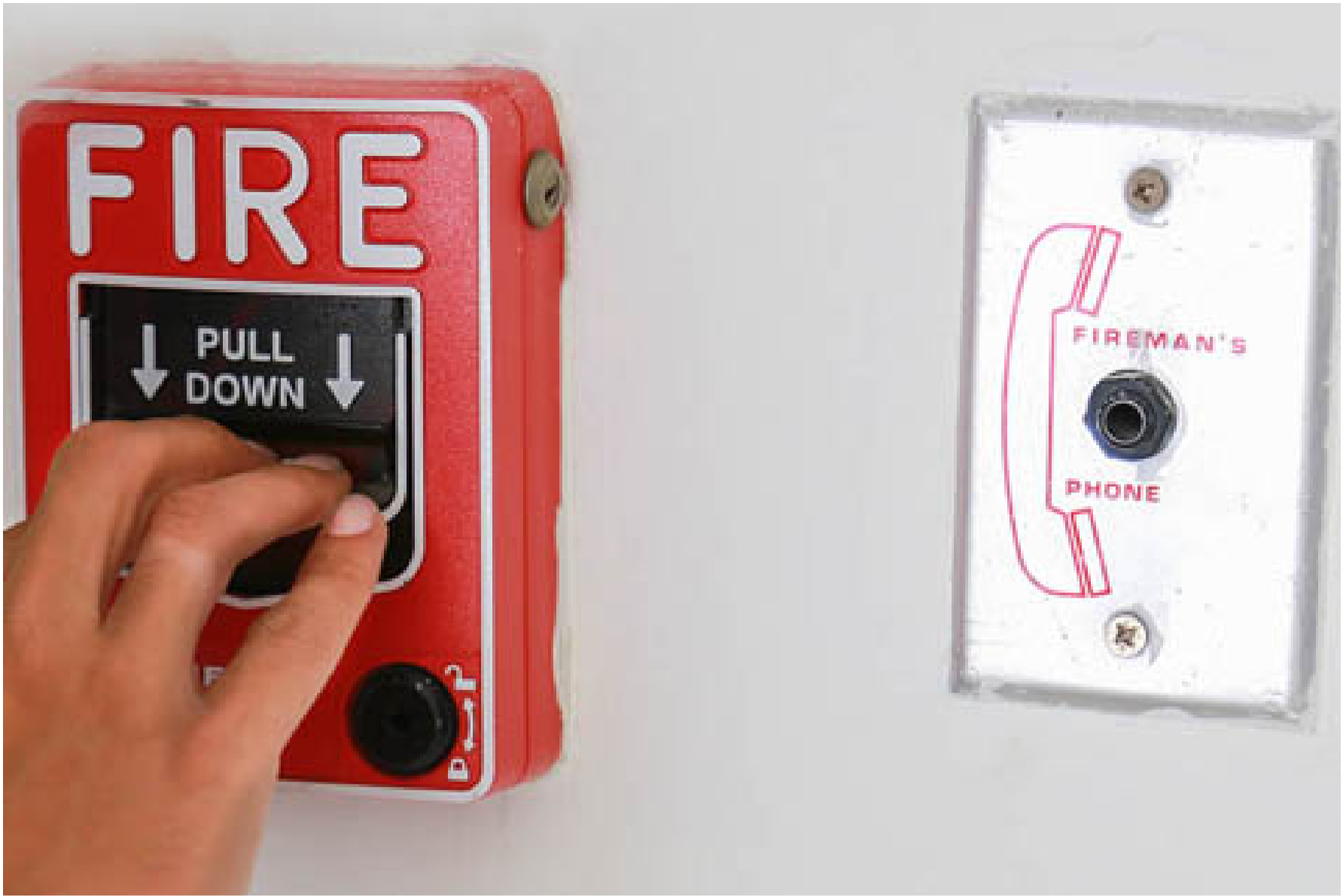
Fire Safety System